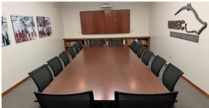
UREC Conference Room